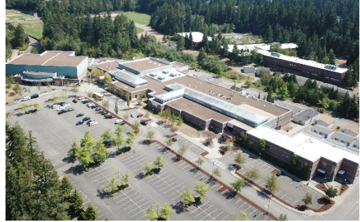
In 2019 with 'D' Wing, Annex and 17 portables